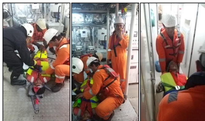
Familiarising with safety evacuation.