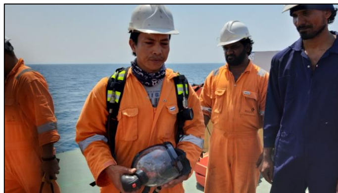
Preparation of Breathing Apparatus.