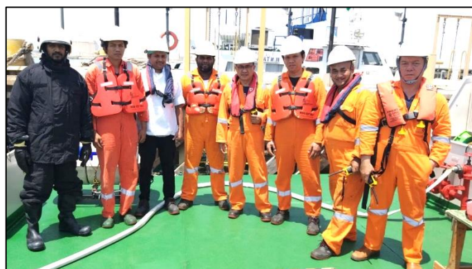
Full involvement of crew.