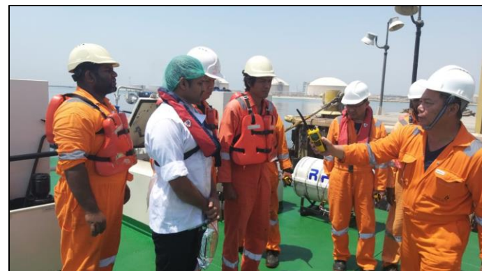
Gathering at muster station.