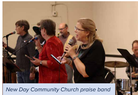
New Day Community Church praise band