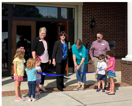
Photos from ribbon cuttings for the Trails of Tails program funded by a Shore Community grant establishing StoryWalks in Boonville, East Bend, Jonesville, and Yadkinville.

Support for the annual Page to Stage program, which includes a live stage performance of the musical James and the Giant Peach to Yadkin County School 4th and 5th graders