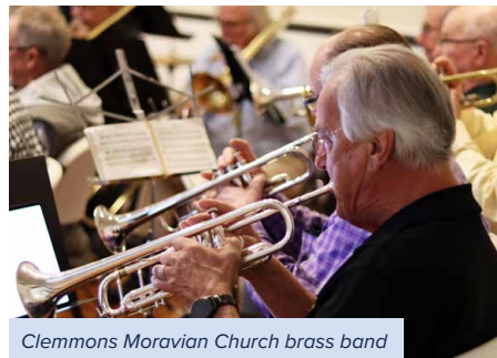
Clemmons Moravian Church brass band