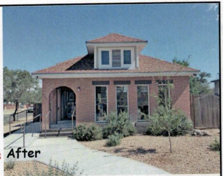
Before & After

Above is a fantastic specimen of a Hipped Cottage in historic Silver Hill neighborhood, a few blocks from Silver Ave. Hipped Cottages have all sides sloping downwards to the walls, with no gables present; the square hip roof is shaped like a pyramid. The example above also has two dormers, which are akin to early skylights, as they provide light and ventilation.