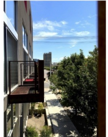
Downtown -- Loft