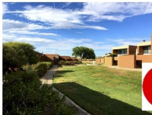
La Luz -- Townhome