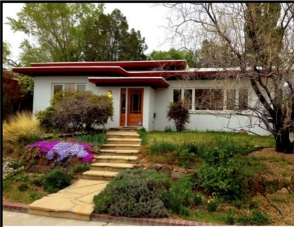
Spruce Park, east of Downtown near the UNM Campus, has some wonderful Mid-Century Modern homes, seen above.