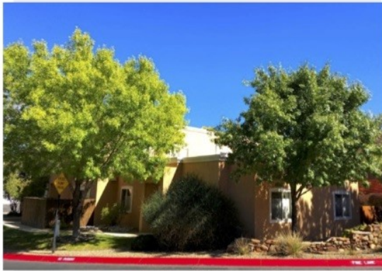
NE Heights -- Condo

Current Listings: Click on any image to view the Visual Tour.