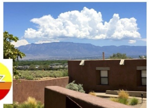
West Side -- Townhome