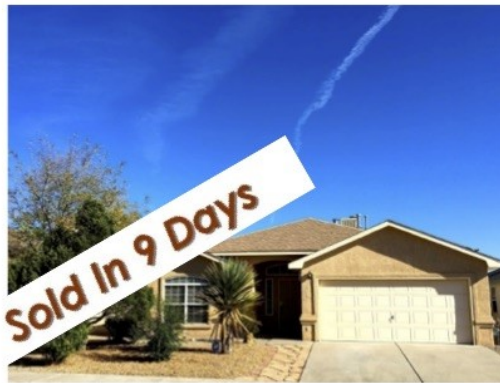
Ventana Ranch -- Ranch