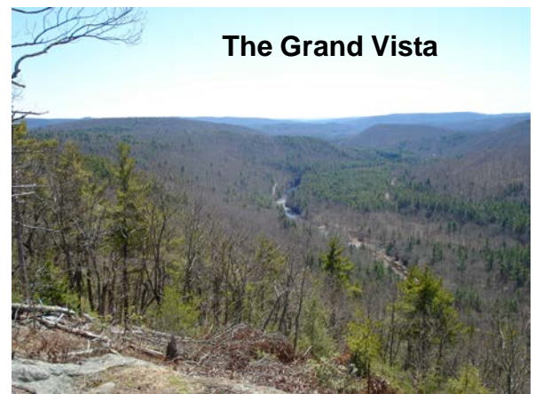
The Grand Vista