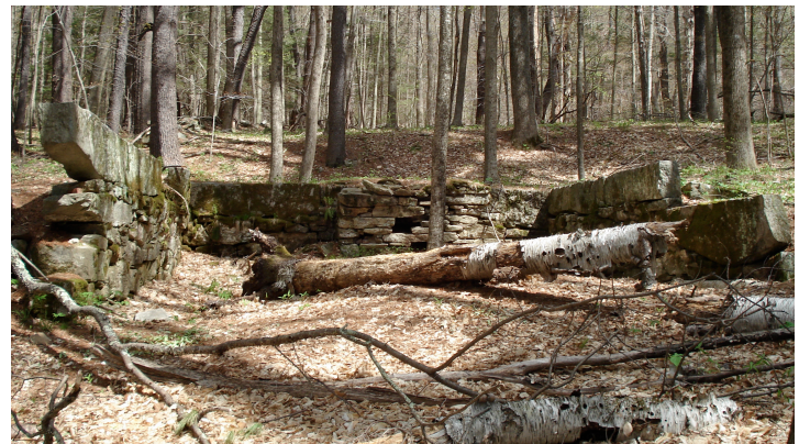
Colonial stone foundation