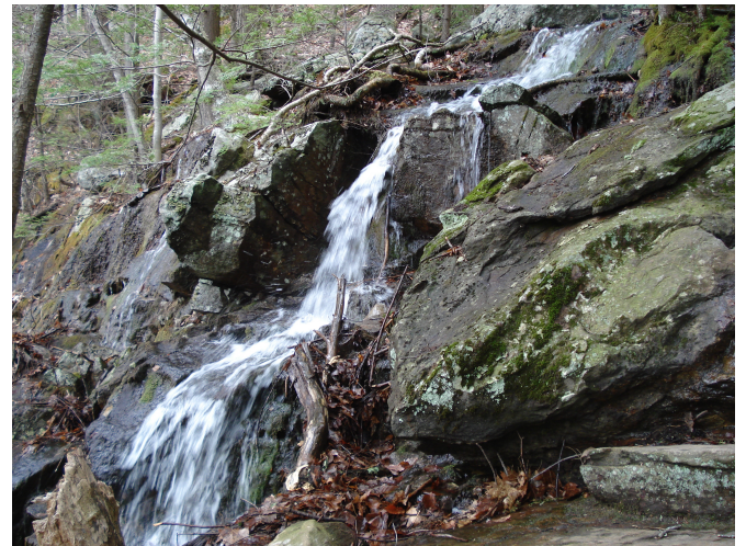
The Falls on the Falls Cut Off Trail