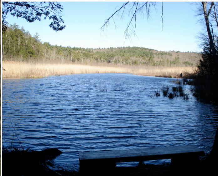
View of the Pond at the end of the Green Trail

Follow the B/Y from its start on Greenwood Rd > to the old & new bridge at 0.2 to the Pond on the G trail at 0.3 to the charcoal mound at 0.6 to the old colonial foundation at 0.9 Reverse direction, & return to your car at 1.7