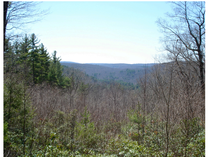
Gothic Window Overlook

The Gothic Window Loop is another good introduction to loop hiking. It is somewhat longer and has more vertical feet than others, but it is a good next “step up” in your hiking experiences. Park at the Gothic Window Overlook ( 41°56'37.93"N 72°59' 46.80"W ), located on the left side of Greenwood Rd 1.5 miles north of the Greenwood Gate. The Overlook is starting to be overgrown, but there are views if you go north on Greenwood Rd for 200 feet, or from a large boulder near your car. Start your hike heading south on Greenwood Rd & in a short distance turn right onto the Agnes Bowen Trail marked by a blue blaze with an orange dot (B/O). At 0.1 mile, turn right onto the Robert Ross Trail with a blue blaze (B). Continue on B looking for the 90° right turn at 0.4. At this turn, the Jessie Gerard Trail, (blue blaze with yellow dot B/Y) joins the B. If you reach a hairpin turn, you went too far. Follow the B & B/Y over a bridge at 0.6, next to the junction with the Fall Cut Off Trail (B/R). Continue straight on B/Y & B, going past the Warner Rd sign at 0.8. The B/Y trail now starts to climb steeply to the Grand View photo op. Continue on B/Y to Chaugham Overlook, photo op at 1.1 and through 2 glacial erratics at 1.3, photo op. Reach Greenwood Rd at 1.6, turn right, returning to your car at 2.6 miles.