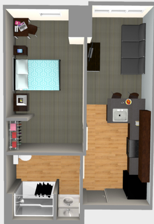
Graduate 1 bedroom apartment