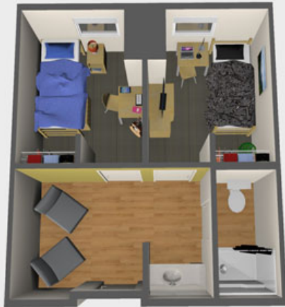
Undergraduate 2 bedroom private suite