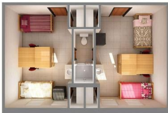
Sample floor plan (Dorman Hall)