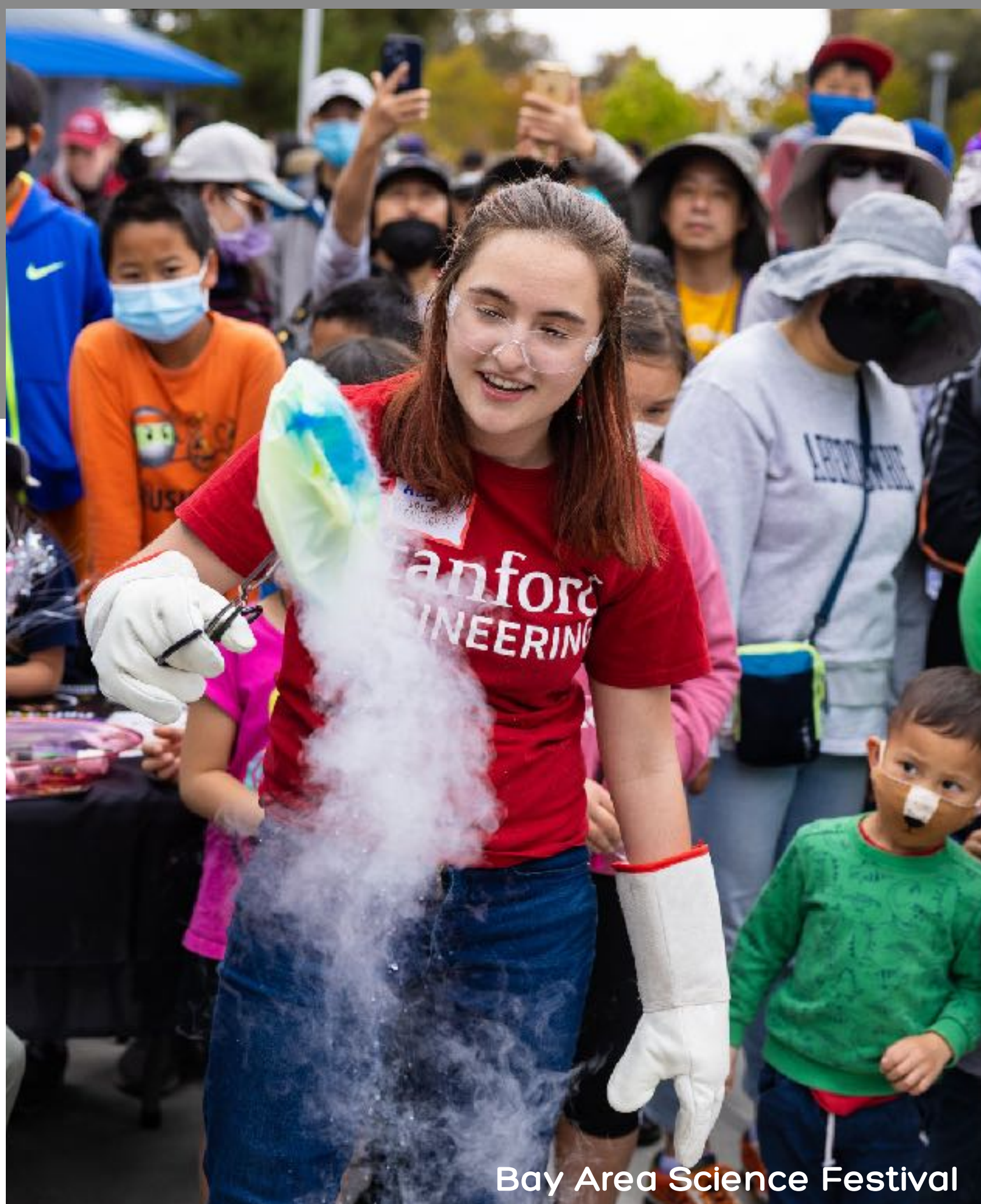
Bay Area Science Festival