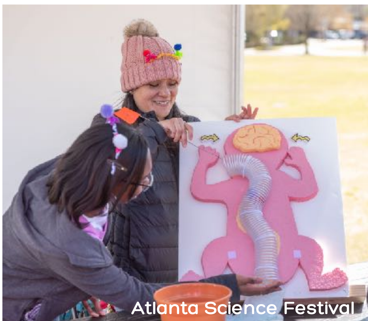
Atlanta Science Festival