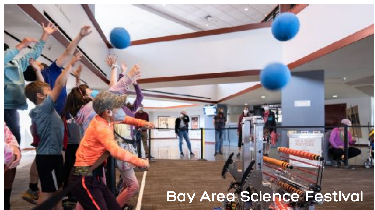
Bay Area Science Festival