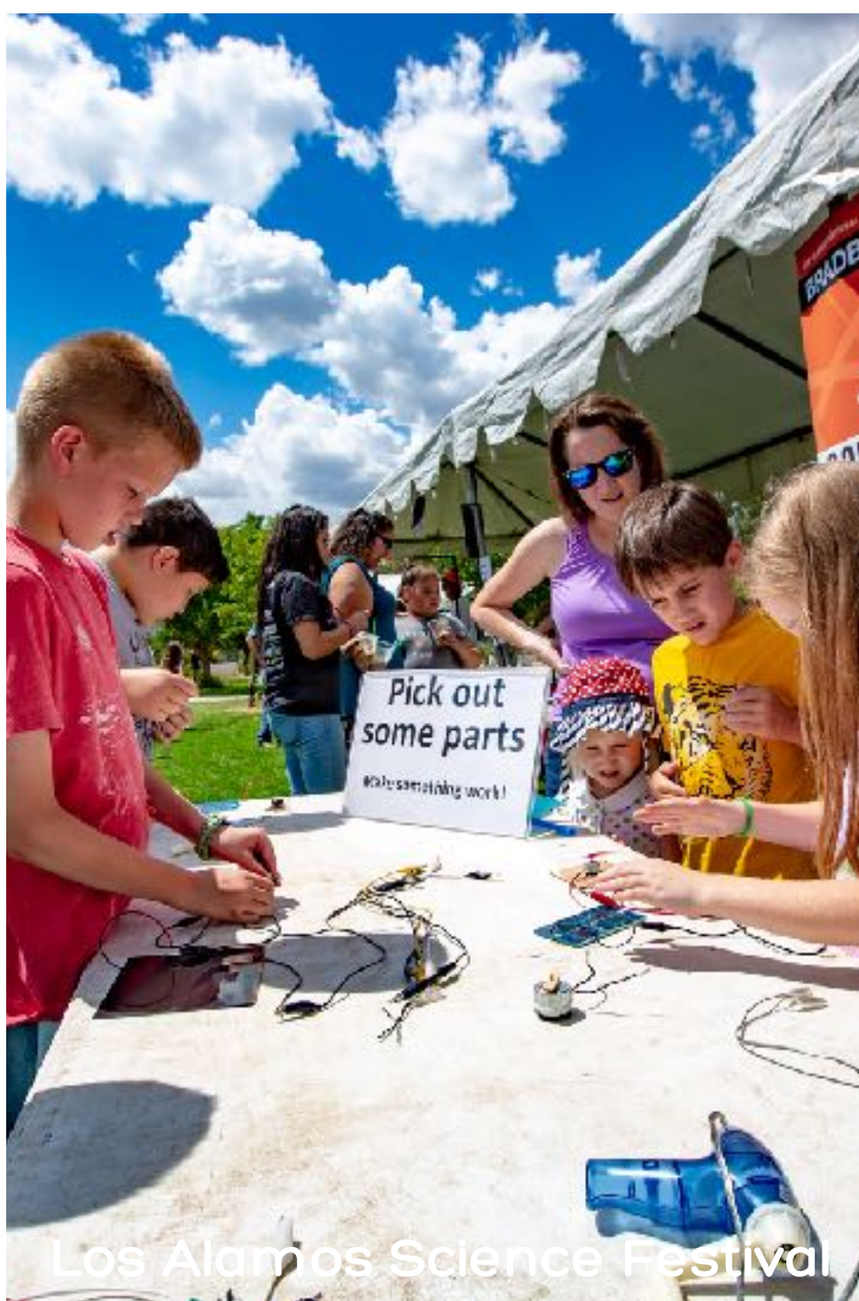
Los Alamos Science Festival