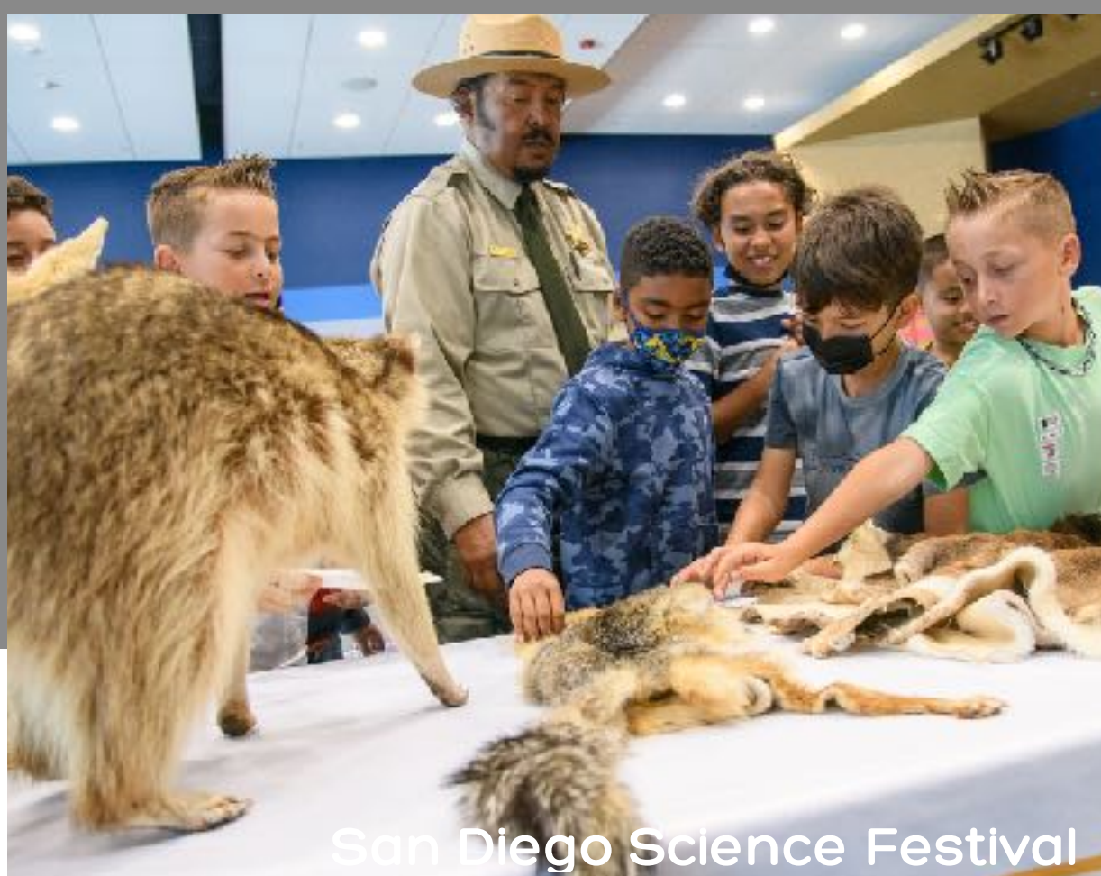
San Diego Science Festival