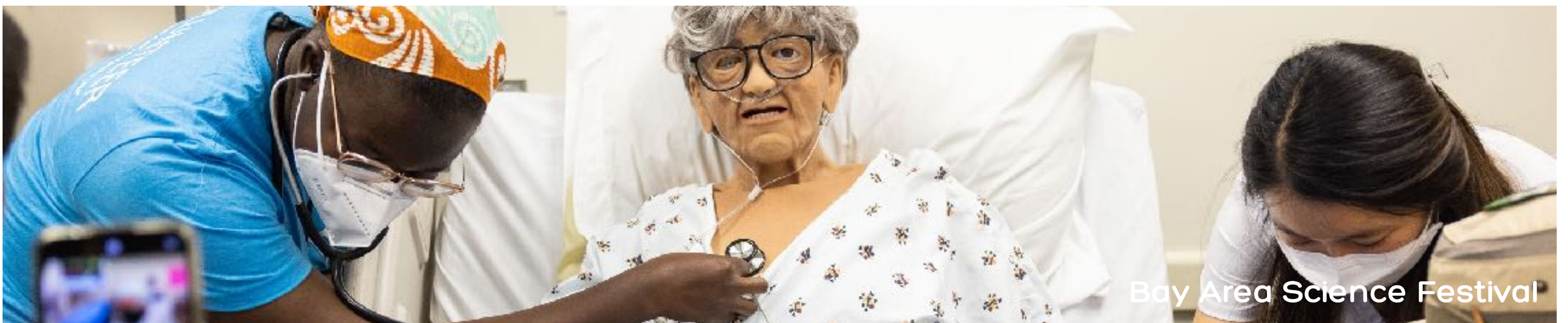
Bay Area Science Festival