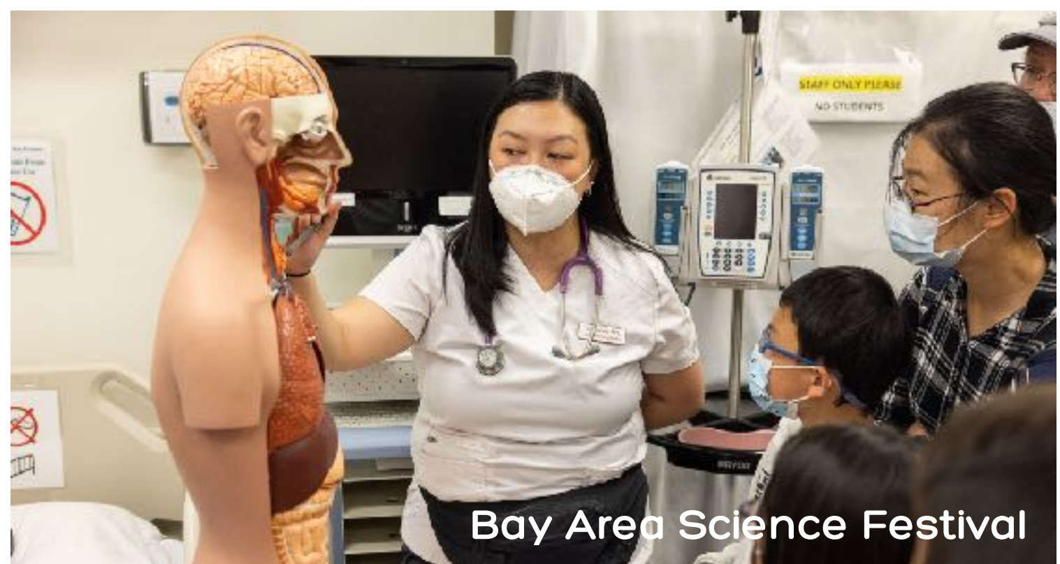
Bay Area Science Festival