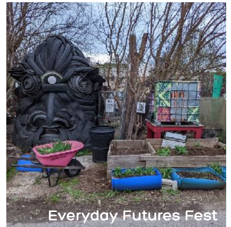
Everyday Futures Fest

Thanks to funding from the Alfred P. Sloan Foundation, the third iteration of the Science Festival Accelerator started in 2018. The goal was to give 12 new festivals a big boost, with diversity issues at the top of the agenda. The plan was to have four established science festivals make diversity issues their top priority for a year before becoming mentors to 3 new festivals each. By the beginning of 2020, it was working well. We selected 12 new festival startups via a competitive application process, sorted everyone into four cohorts, and launched an intensive 6-month professional development program. But as it turns out, January 2020 was not the best time to accelerate local communities toward big in-person celebrations.