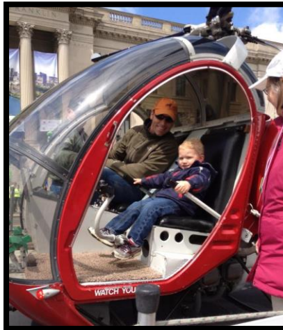
The Franklin Institute 222 North 20th Street Philadelphia, PA 19103