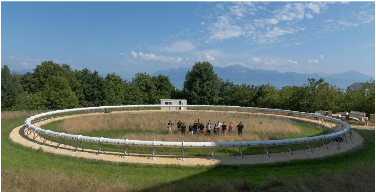
Swisspod Team standing in the middle of the only circular infrastructure in the world - link to download

Swisspod Technologies SA Route de Clos-Donroux 1 1870 Monthey, Switzerland