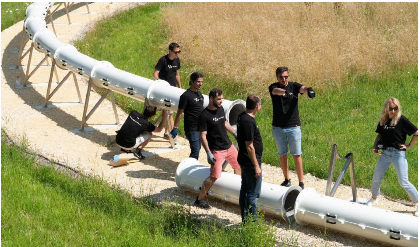
Swisspod Team assembling the circular infrastructure - link to download

The infrastructure is constructed in a circular shape to simulate an infinite Hyperloop track and accommodate a diverse set of experimental conditions, such as different levels of pressure, speed and trajectory lengths. Swisspod worked constructively on the optimal design of the facility that is owned and operated by the Distributed Electrical Systems Laboratory (DESL), EPFL. Swisspod will benefit from knowledge transfer and synergies from EPFL as part of the joint effort. For the first research activity funded by the Swiss Innovation Agency, Swisspod and EPFL will join forces with HEIG-VD .