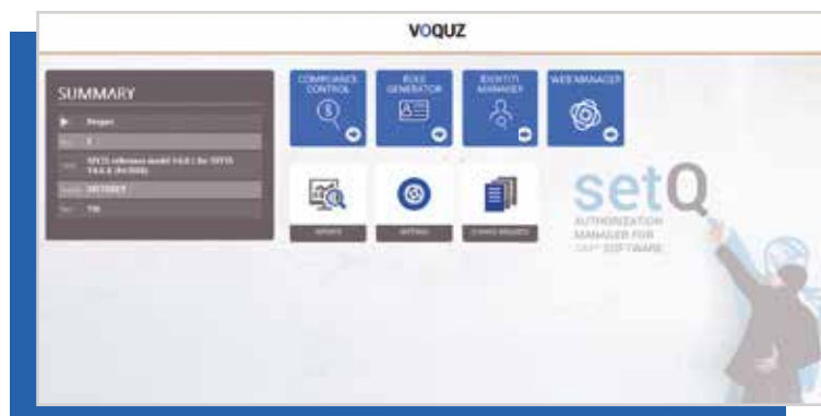
Figure 1: setQ user interface – your cockpit for easy authorization management

Even during the plug-and-play creation of new roles and concepts, setQ runs real-time checks for critical SOD conflicts in the background and can prevent them from being pushed to production automatically. The deployment of your new roles follows a transparent ruleset and does not require complicated tinkering to get started. While legacy Identity Management for SAP requires complex knowledge and months of setup and refinement, a setQ install is fast and simple.