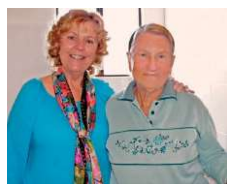
We all have a duty of care