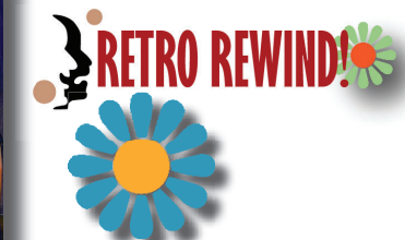
Urinetown - The Musical