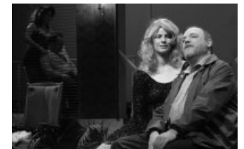
DS REWIND! The Best Little Whorehouse in Texas