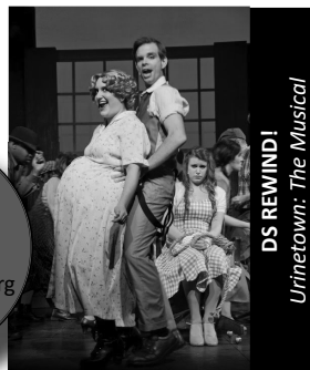
DS REWIND! Urinetown: The Musical

More photos online and coming at DominionStage.org