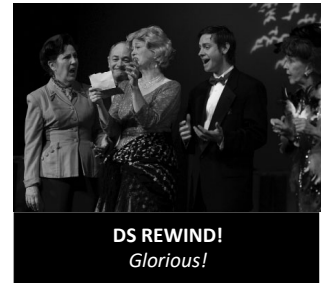
DS REWIND! Glorious!