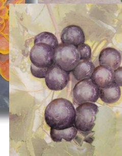
Original Art by Diedre (De) Nicholson-Lamb