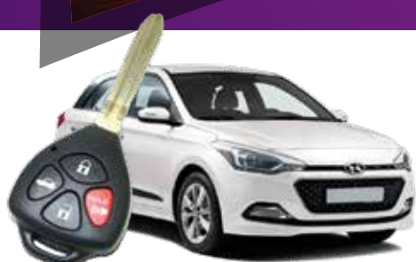
COMPUSTAR Remote Starter Using Your Factory Remote