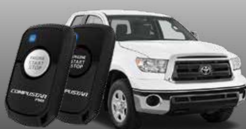
COMPUSTAR Prime 2-Way LED 3,000-ft Range Starter