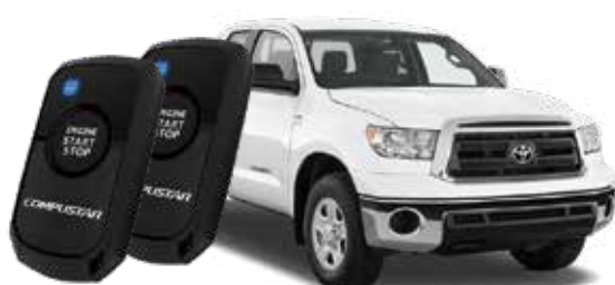
COMPUSTAR Prime 1-Way 1,500-ft Range Starter