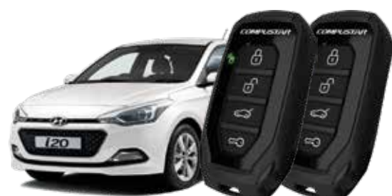
COMPUSTAR Prime 1-Way 2,000-ft Range Starter