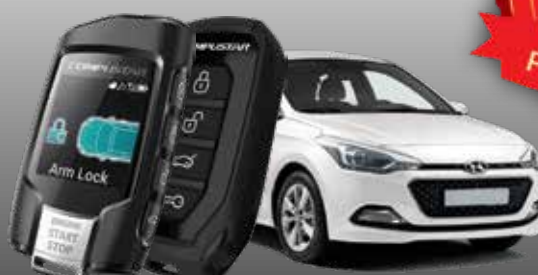
COMPUSTAR Prime 2-Way LCD 3,000-ft Range Starter