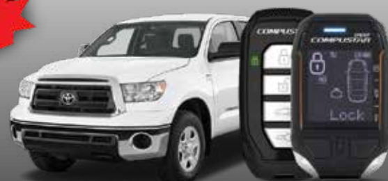
COMPUSTAR Prime 2-Way LCD 15,000-ft Range Starter