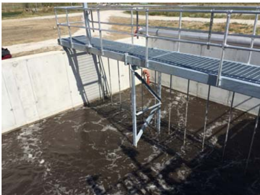
Aerobic Digester with Air Bridge & G-O™ Diffusers

Each project is unique. Your site conditions are unique. Your process requirements are unique. We are uniquely positioned to respond quickly to your needs with customized solutions that are designed to meet your needs.