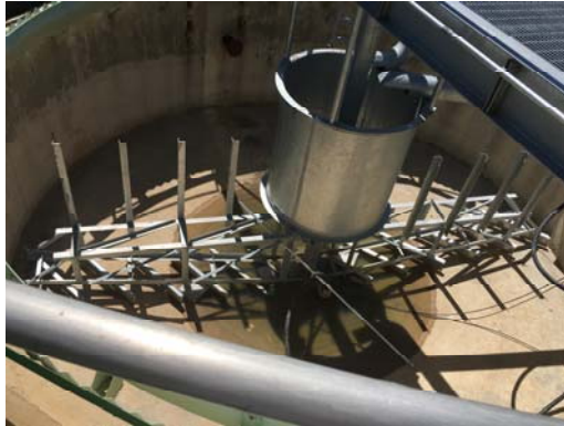
Gravity Sludge Thickener

G-H Systems has designed and manufactured water and wastewater treatment equipment since 1984. Around the U.S. and around the world, we're proud to have earned a reputation for technical excellence, professionalism and dependability. Our complement of seasoned personnel are at your service. You can rely upon G-H Systems for both our equipment designs and our process engineering expertise.