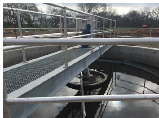
Bridge Supported Clarifier