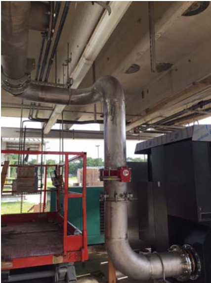
Blower Piping and Valves.

The equipment we manufacture endures the test of time. The process systems and equipment we design with our customers perform to the most rigorous standards. The relationships we build with our clients ensure operational reliability that extends far beyond the project completion.