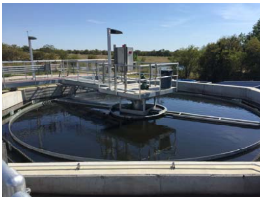
Center Pier Supported Hydraulic Differential Clarifier

We dedicate ourselves to the concept of personal service every day. G-H Systems delivers service the old-fashioned way: quickly, completely and directly. On your project, you are the most important person. We always remember that. We treat you that way.