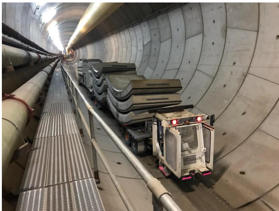
The 70-ton TSP transporting segments