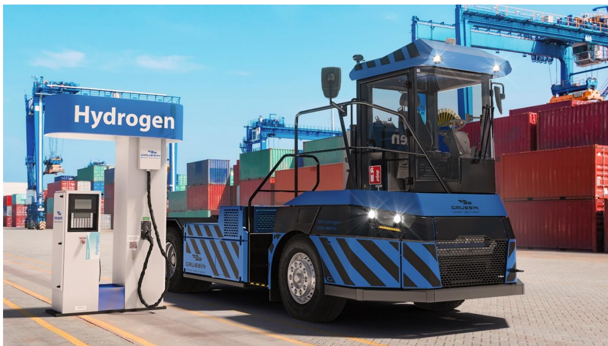
GAUSSIN's APM® for port operations