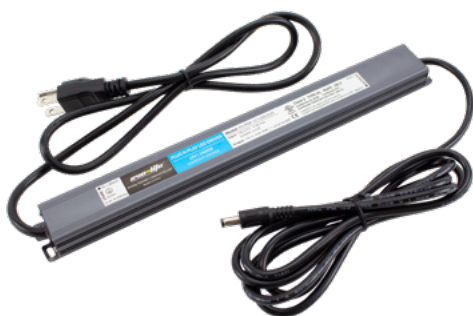
A PLUG-N-PLAY POWER SUPPLY 12V 60W