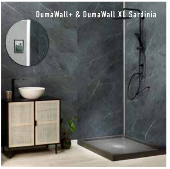
Images are for display purposes only. Visit www.psp.co.nz to view our installation guide.