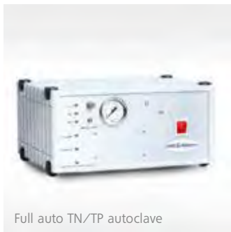
Full auto TN/TP autoclave

Automatic handling of external modules and accessories for automation of complex chemistries and sample preparation.