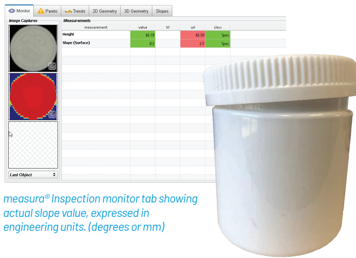
measura ® Inspection monitor tab showing actual slope value, expressed in engineering units. (degrees or mm)

Sightline's 3D Imaging Software, measura ®, can easily detect and reject containers with crooked, damaged or missing caps, as well as canisters that were not properly sealed.