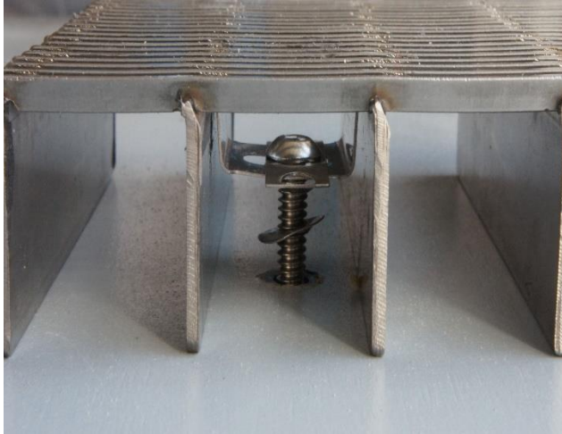
10. The BaseGrille is now secured using lock downs.