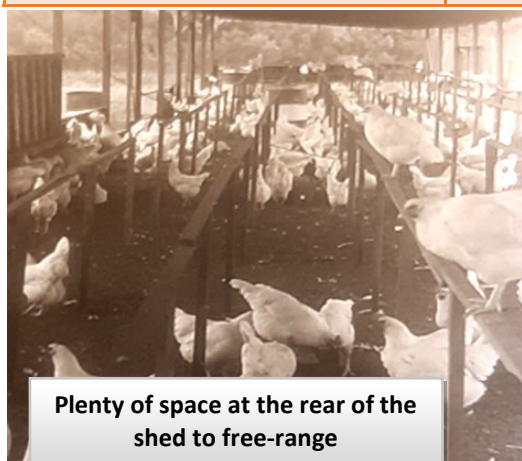
Plenty of space at the rear of the shed to free-range