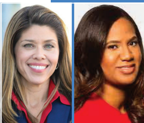
South Mountain District