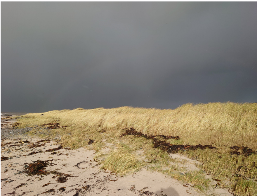
Sunstruck dunes and dark rain clouds vie for position