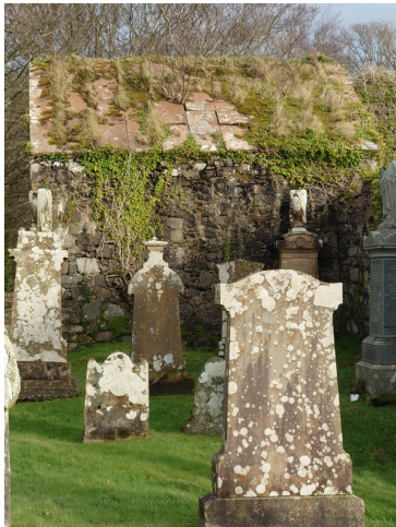
St John's churchyard