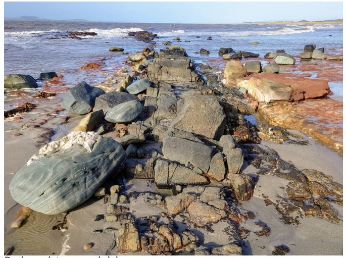
Red sandstone and dyke