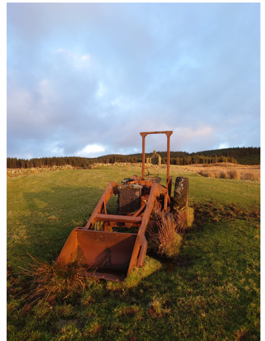
Retired tractor and ruins near High Clachaig