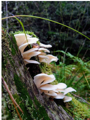
Angels Wings in Autumn