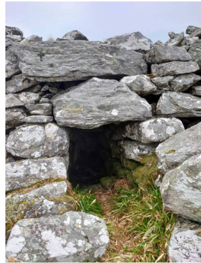
Dun a' Choin Dhuibh.