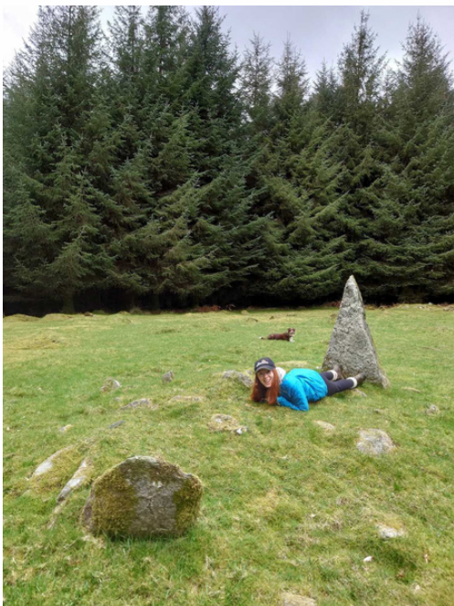
How tall are you? The Giant's Grave.

Below the Dun lies the older bronze age Giant's Grave. The headstone and footstone lie some 3.5m apart; it is said that this was the grave of Diarmid, founder of Clan Campbell. Following tracks further into the forest the ruins of the old settlement of Achelach can be found, its stone buildings more likely to have been built in the 18th Century. Beyond man's stonier remains the ancient woods that fringe the forestry plantations are rich in wildlife, including quite an array of fungi in autumn.