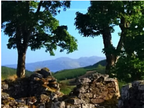
View SW to Meall Mor and Stob Odhar