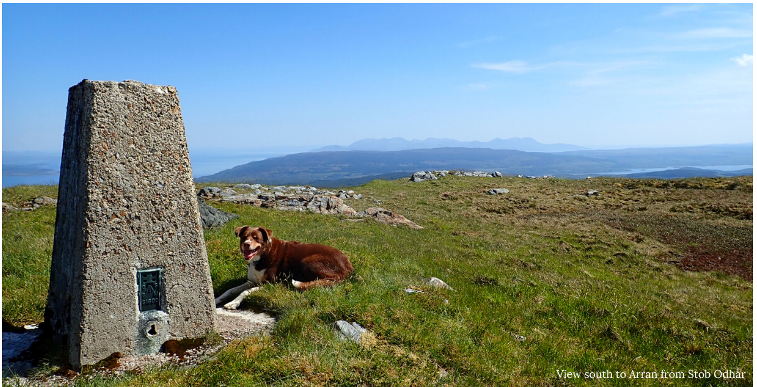
View south to Arran from Stob Odhar