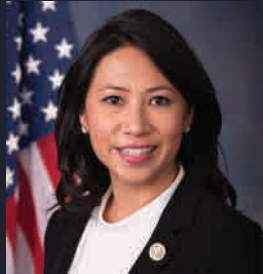
US Representative Stephanie Murphy (D) (US) Congresswoman for Florida