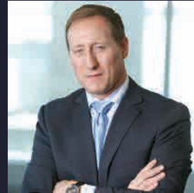
The Honorable Peter MacKay (CAN) Former Canadian Cabinet Minister