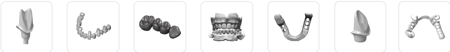
Custom Abutments Screw Retention Bridge Crown Bridge Denture Surgical Guide Hybrid Abutment Framework