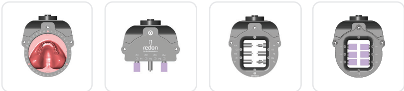
Denture Holder Custom Glass Ceramic / Premill Holder Premill Holder Glass Ceramic Holder