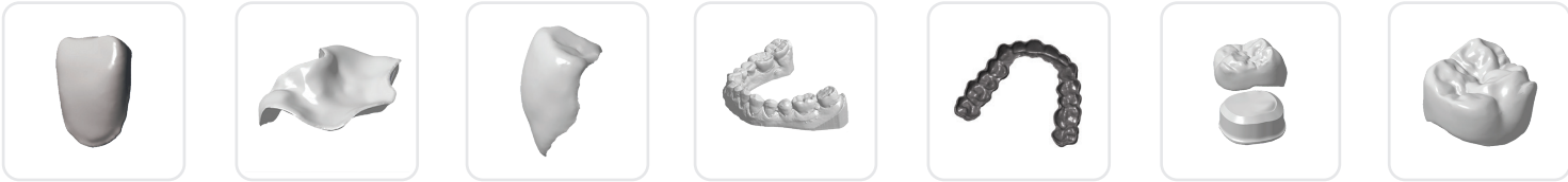
Veners Inlay Onlay Model Splint Telescope Crown