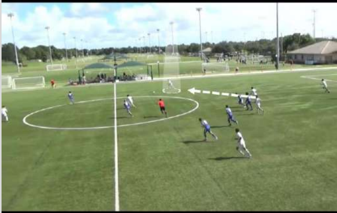
POSITIONING AND MOVEMENT

He wins many duels in his interpretation of space-time. He always seeking to appear as a "free man" on the weak side and be able to keep the possession. He handles good concepts to give continuity to the play. This is supported by a technical capacity that allows him to be dynamic in all the zones of the pitch. He offers complete and intelligent movements per band generating superiorities.