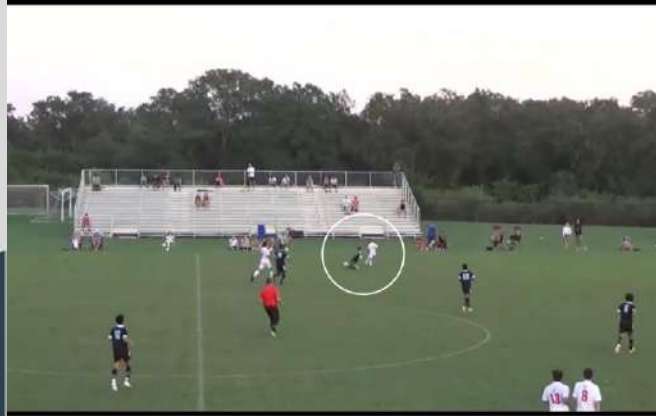
CLEARANCES AND ANTICIPATIONS

He wins many duels in his interpretation of space-time. He always seeking to appear as a "free man" on the weak side and be able to keep the possession. He handles good concepts to give continuity to the play. This is supported by a technical capacity that allows him to be dynamic in all the zones of the pitch. He offers complete and intelligent movements per band generating superiorities.