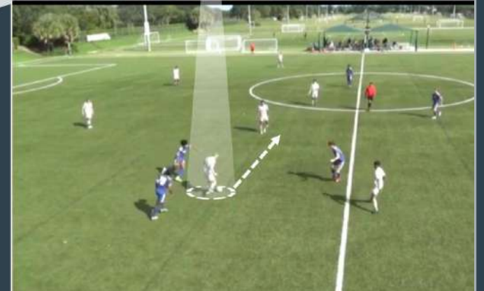
SOLVING UNDER PRESSURE

He dominates interceptions at close range. He manages to win the duel against the rival from his physique, where he possesses aptitudes above the average of the position and his generation, as well as his defensive concepts. He does not usually run long distances, preferring using his timing and maintaining the defensive tactical order.