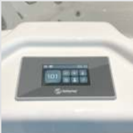
Color LCD Touchscreen