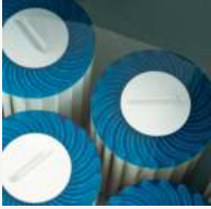
100% Filtration SilentFlo Circulation