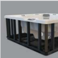
Polymer Substructure & Base Pan