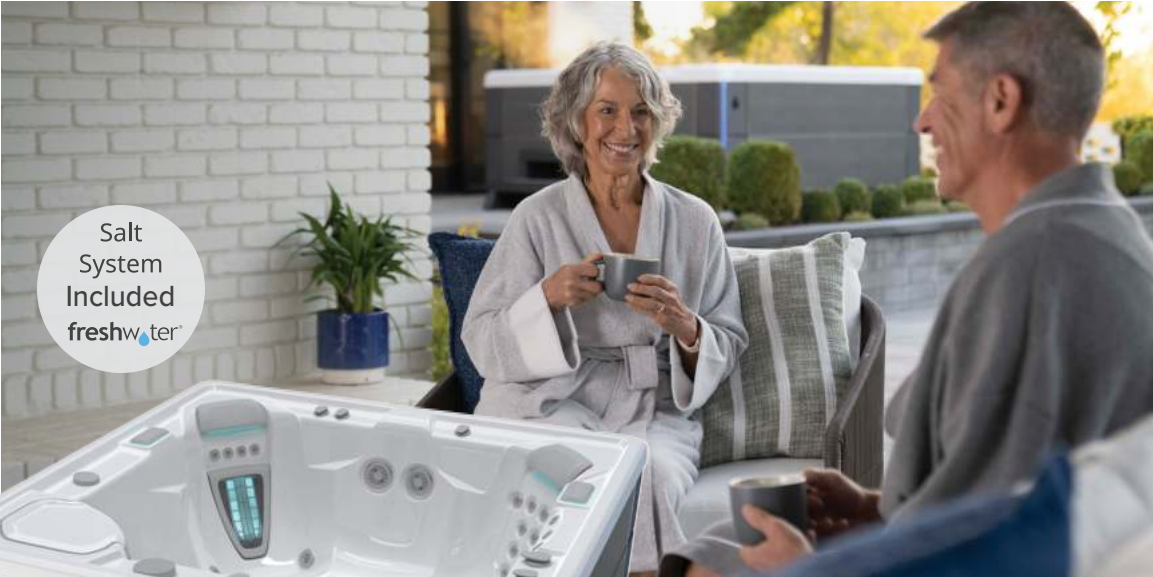
Shown with Alpine White Shell and Java Cabinet

People Seating Jets Voltage 5 Seats Open 28 Jets 230 V