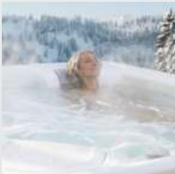
Super Energy Efficient