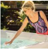
FreshWater® IQ System Ready