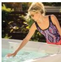
FreshWater® IQ System Ready