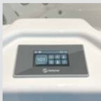
Color LCD Touchscreen