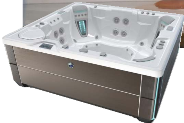
Shown with Alpine White Shell and Java Cabinet

People Seating Jets Voltage 7 Seats Open 49 Jets 230 V