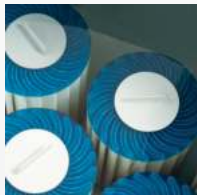
100% Filtration SilentFlo Circulation