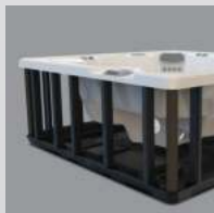
Polymer Substructure & Base Pan