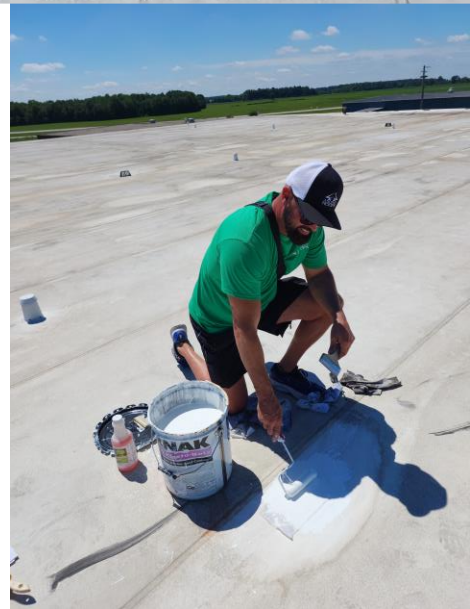
Performing an adhesion test with Karnak 502

This choice saved the customer tens of thousands of dollars and extended the roof's life by 10 to 15 years.