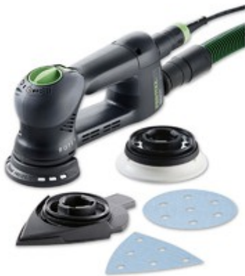
Festool Rotex 90