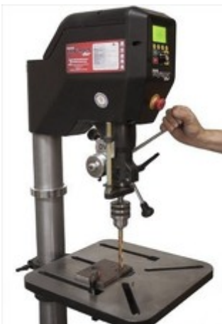
Nova Voyager Pillar Drill