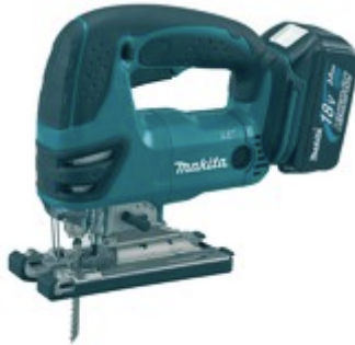
Makita Cordless Jigsaws