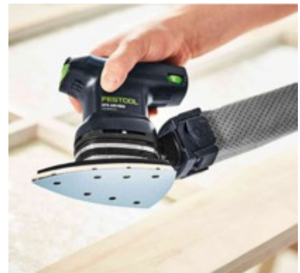
Festool Sander DTS400