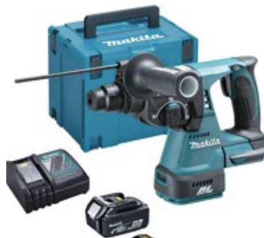
Makita Rotary Hammer Drill