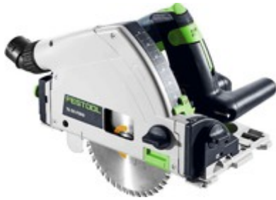
Festool TS 55 Rail Saw