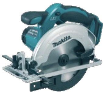
Makita Circular Saw 165MM LXT