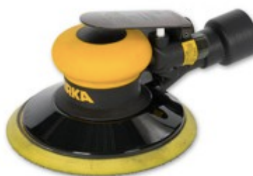
Mirka Pneumatic Orbital Sander