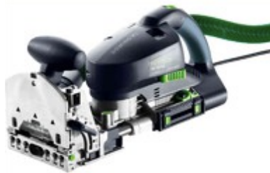
Festool DF-700 Domino XL