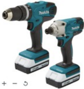
Makita Drill and Impact Drivers