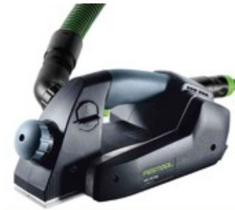
Festool EHL65 Power Planer