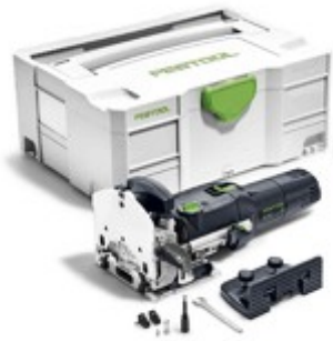
Festool DF-500Q Domino Jointer