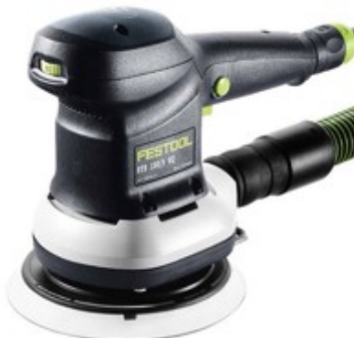
Festool Eccentric SaNDER ETS 150