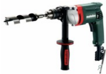
Metabo Corded Drill