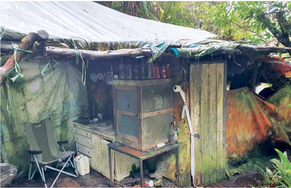
Owners of illegal huts like this one in the Tongariro Forest will be allowed time to remove them.

The Department of Conservation has announced it will remove illegal huts found in the Tongariro Forest. “DOC cannot accept liability for the risks associated with these huts and, because their construction is in breach of The Conservation Act 1987, their removal is required,” the Department has announced. DOC Tongariro will begin operations to remove all known illegal huts in Tongariro Forest and will monitor to ensure compliance with legislation that no further huts are constructed illegally on public conservation land. “Not only is the construction of any structure on pub-