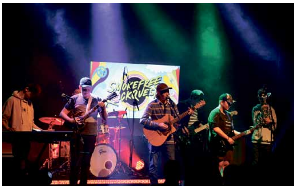
Ruapehu 'Rock' College was well-represented at the recent regional Smokefree event in Whanganui.

EYE ON RUAPEHU COLLEGE, CONTRIBUTED BY STAFF AND STUDENTS