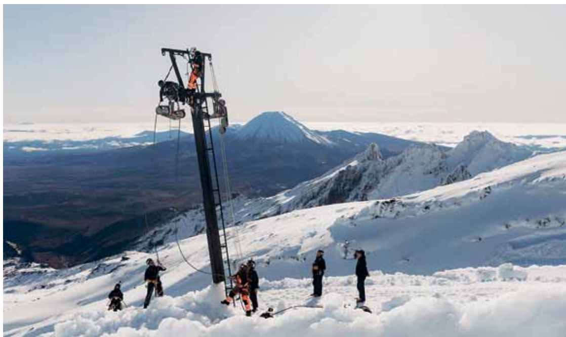
RAL maintenance staff work on the Far West T-Bar.

The next round of applications for the Kanorau Koiora Taketake – Indigenous Biodiversity Community Grant opens in April 2023. More information about what grants Horizons has available to community groups is at horizons.govt.nz .