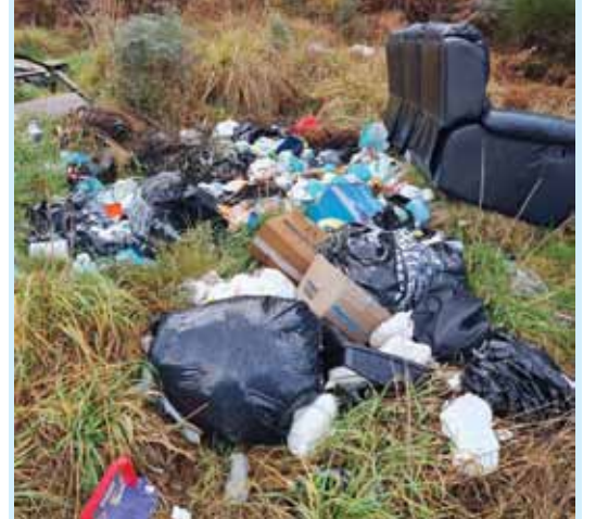
A pile of illegally-dumped rubbish at Rangataua Forest has dismayed locals.

"If you observe any dumping of rubbish on public land, please contact your local DOC office or local council.