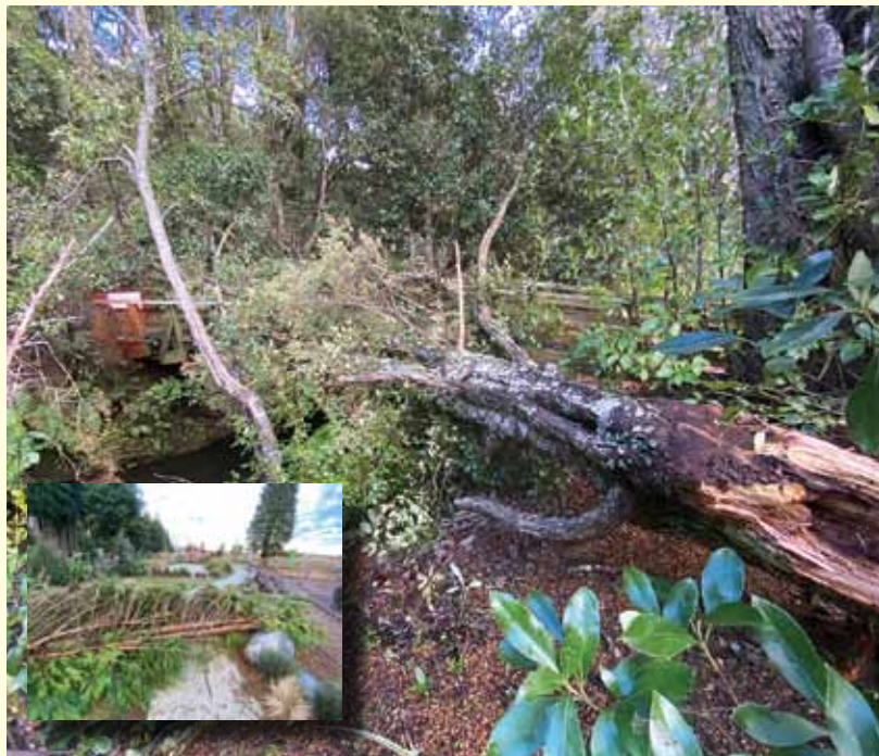
The footbridge over the Mangateitei Stream at the back of the Ohakune Top 10 Holiday Park is closed indefinitely, reports Ruapehu District Council. The bridge was smashed last Thursday night/Friday morning when strong winds brought down a beech tree next to the bridge. The centre beam of the bridge has completely broken away and the others are badly damaged. The bridge – that provides access to the Jubilee Park bush walks – will need major repairs before being reopened, says RDC. Inset: a tree was also brought down across one of the paths at the Ohakune Adventure Carrot Park.