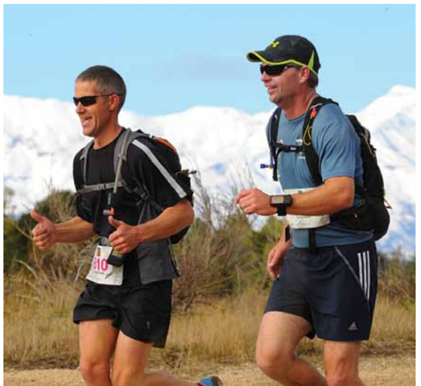
MBIE funds will help boost several events around Ruapehu, including the T42 race.

For more information on the Thermal Explorer Regional Events Fund and to view the full list of funding recipients, visit waikatonz.com/thermexref