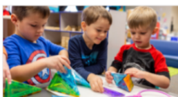
Preschool - Aberdeen Roncalli Roncalli Sonshine Patch is located within Roncalli Primary School at 219 1st Ave NE, which houses Pre-K/2nd grade classrooms. We offer preschool/childcar...