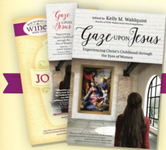
Bundle - Book, Journal & Bookmark — available at retreat for $25