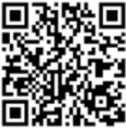
Bazaar Volunteer sign up QR code