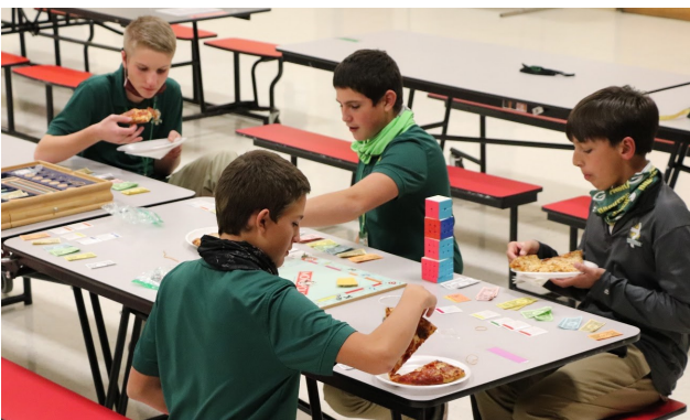
GAME NIGHT "MASH UP"

On November 23, the Golden Rule Crew supplied the 1st responders of the area with a cup of coffee, donut and prayer card for their hard work and dedication. They have been working with the younger students at recess on conflict mediation and helping in the lunchroom.