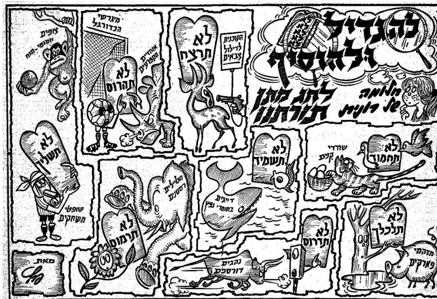
The New Ten Commandments