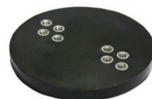
Magnetic Camera Bracket Model MMB

A perfect choice for a wide range of applications in utility vehicles and mobile machinery. View our video on https://www.cspvehiclecameras.co.uk/