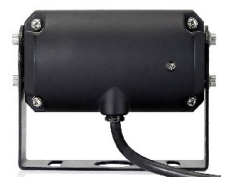
Rear View of CSP-409