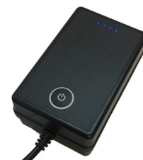
Magnetic Rechargeable Battery Pack Model: RBP