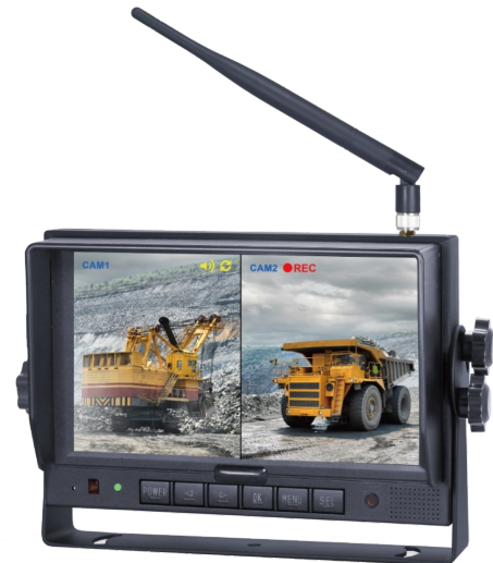
7" Wireless Monitor Built-in Recorder Micro SD Card Model: MRW