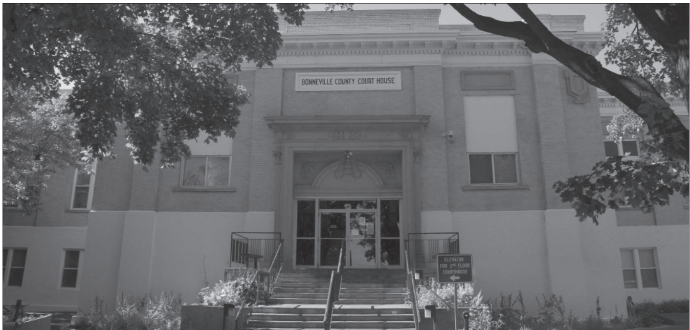
Bonneville County Courthouse, Idaho Falls, Idaho